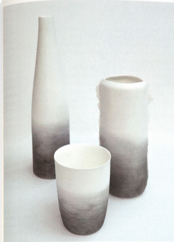
Atelier Murmur, Teinté